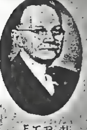
E. T. Battle Meat Retail